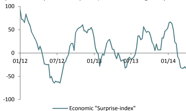
Graph 1: evolution in positive and negative surprises in the economic data compared to the consensus expectation (>0 = more positive surprises; <0= more negative)

Rather than shifting into higher gear, economic indicators fell well short of expectations (Graph 1). The exceptionally severe winter weather was consistently blamed for every unpleasant surprise. But isn't it a bit odd that not a single economist seems to have been able to factor this into their forecast?